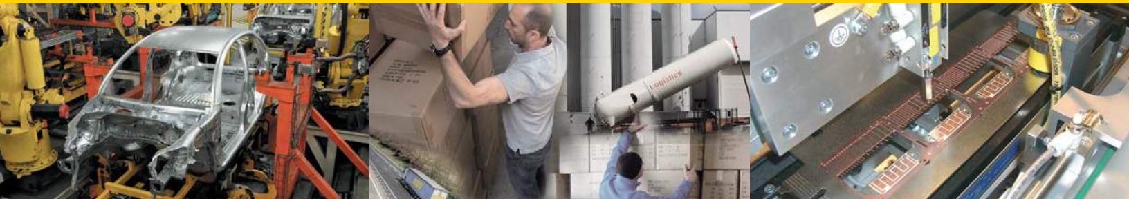
Integrated identification of all components in car assembly process

RFID systems contain three parts: the tag, transceiver, and interface. Tags can be active (requiring a battery) or passive. These tags contain internal circuitry that respond to a specific radio frequency, which is provided by the transceiver. The transceiver, which is often called a reader or antenna, is responsible for communicating with the tag. The interface is the means of communicating the data to a higher level data collection device, such as a computer or a programmable controller. RFID in the industrial environment enables customers to improve accuracy, provide faster production speeds and minimize errors, and achieve substantial cost savings from both a material and labor standpoint.